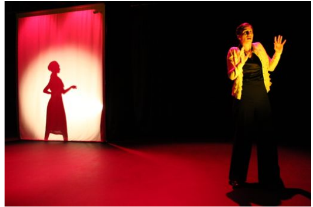
Scarlet Woman 3