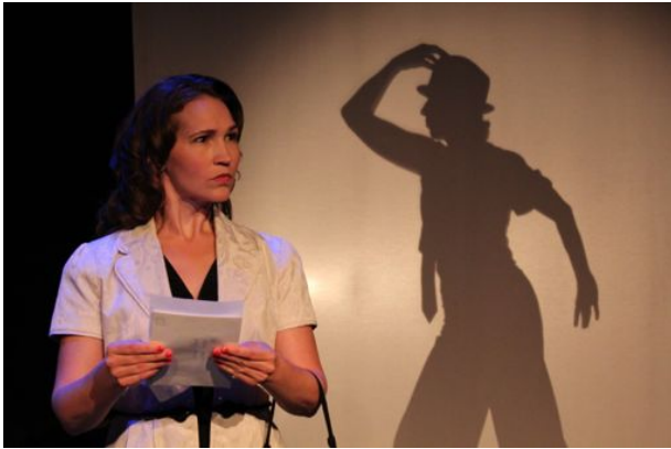
Scarlet Woman 2

High-res photos available by request or download here: www.sunsetgunproductions.com