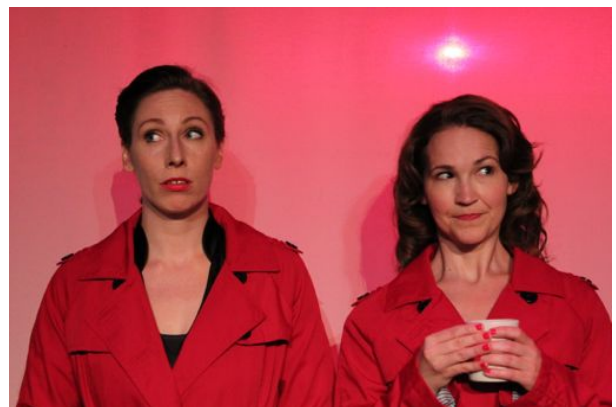
Scarlet Woman 9