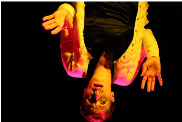
Scarlet Woman 6