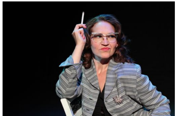
Scarlet Woman 7