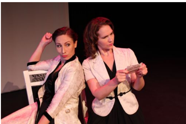
Scarlet Woman 8